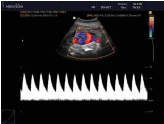
Umbilical artery in Doppler